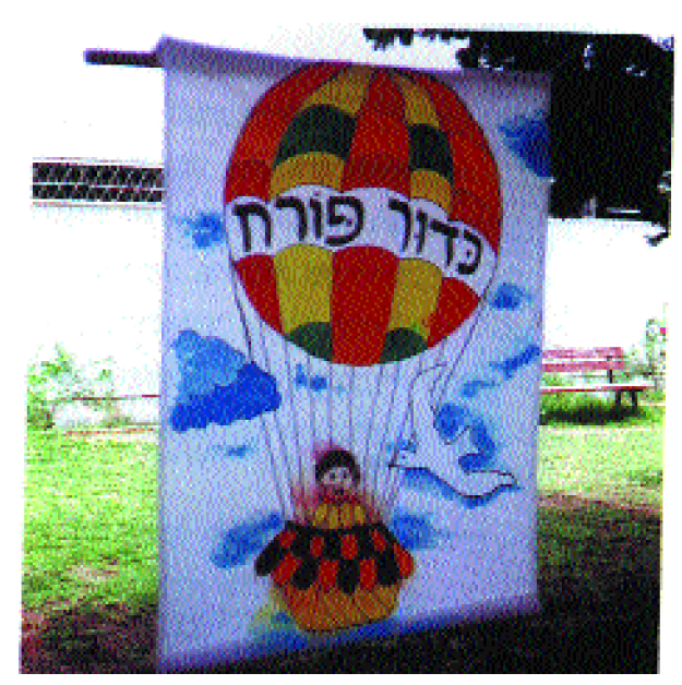
The above banner was displayed at a joint learning festival for students with and without special needs.

This emphasis on integration is in stark contrast to the tautology described in the Definitions section of the law. Critics claim that these diametrically opposing parts of the same law create legal and administrative ambiguity, enabling the Ministry of Education (MOE) to interpret as it sees fit.